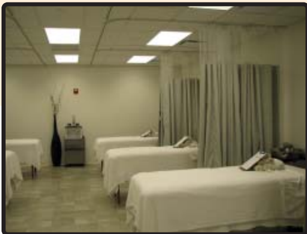
The Esthetics Clinic at Brown Aveda TM Institute Rocky River

As a condition of enrollment or employment, students and employees must abide by the terms