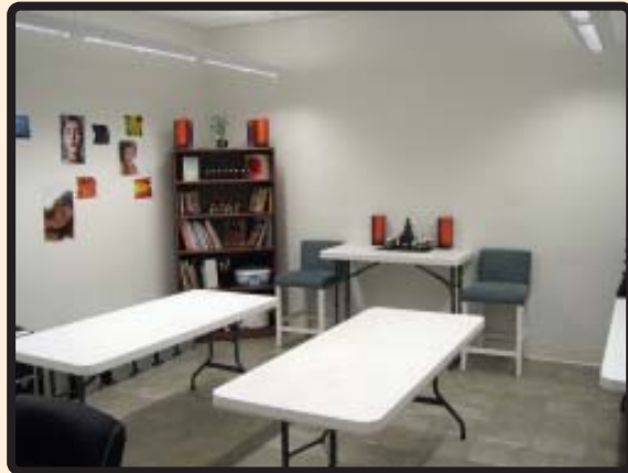
Esthetics Classroom at Brown Aveda™ Institute Rocky River