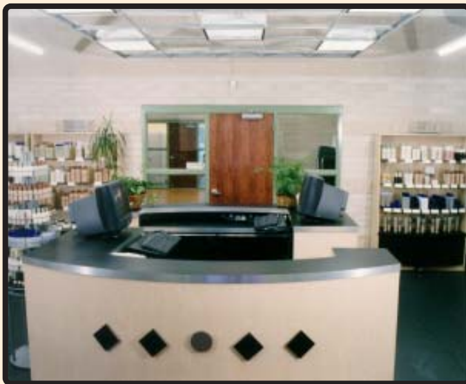
WELCOME to Brown Aveda™ Institute Mentor

Brown Aveda™ Institute does not recruit ANY students from other schools or institutions.