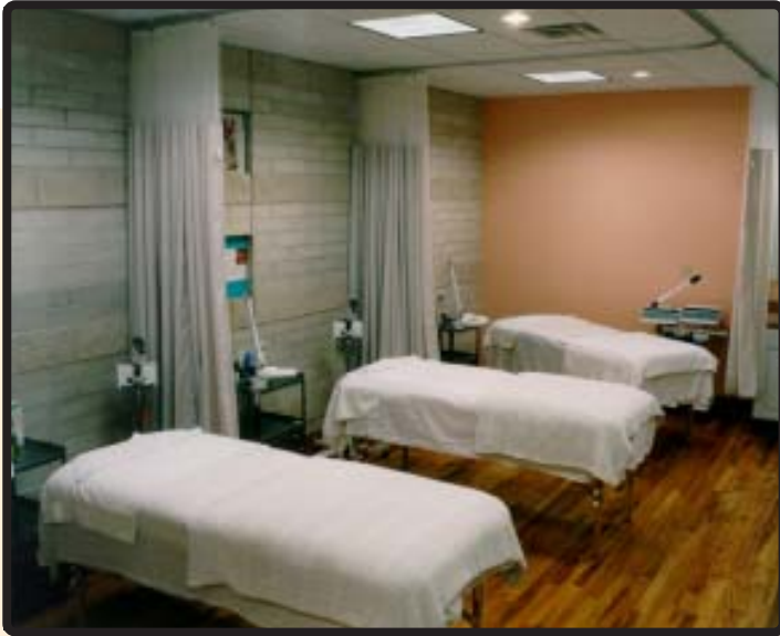
Brown Aveda™ Institute (Mentor) has a separate area for the study of spa services

See insert, or on website see Enrollment - Tuition & Start Date tab