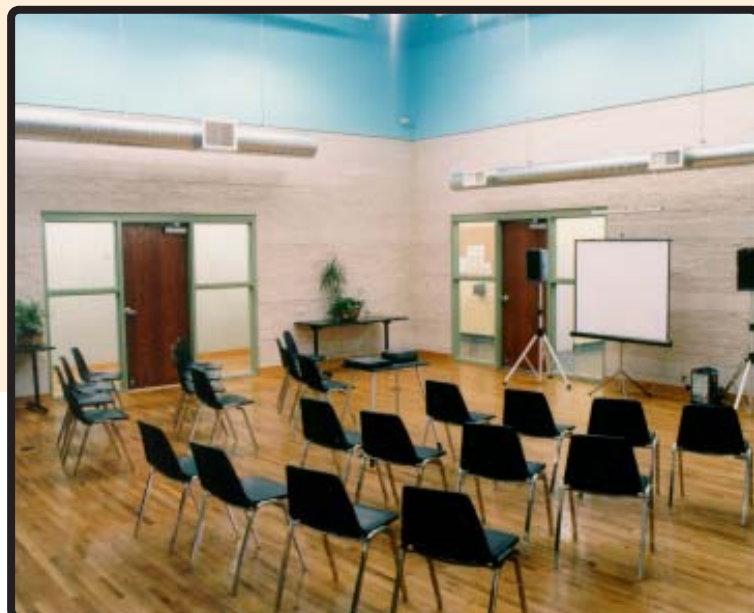
The spacious central atrium is ideal for larger gatherings and lectures at Brown Aveda™ Institute Mentor