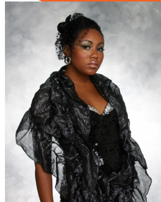
2010 Esthetics Winner

Of those that compete two cosmetology and one esthetic winner are chosen to receive a full scholarship to attend either location of Brown Aveda Institute. Please review all rules and details of the contest in order to be eligible to compete and accept the scholarship. Please be sure to include the application along with your essay and questions. Applications will not be returned .